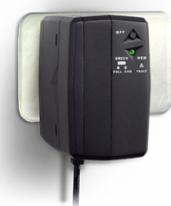
UPS in operation

The UPS is equipped with 1m long cable and its compact size allows fitting it between other plugs in an extension cord. 12VDC is a global standard and 25W output on coaxial DC connector (OD 5.5mm / ID 2.5mm) will be compatible with most of your devices. High quality Samsung Lithium-Ion battery provides 3h backup time for typical router.